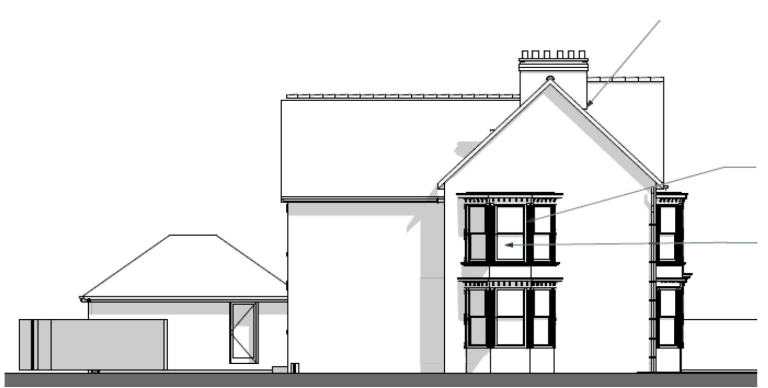
Side elevation facing The Crescent