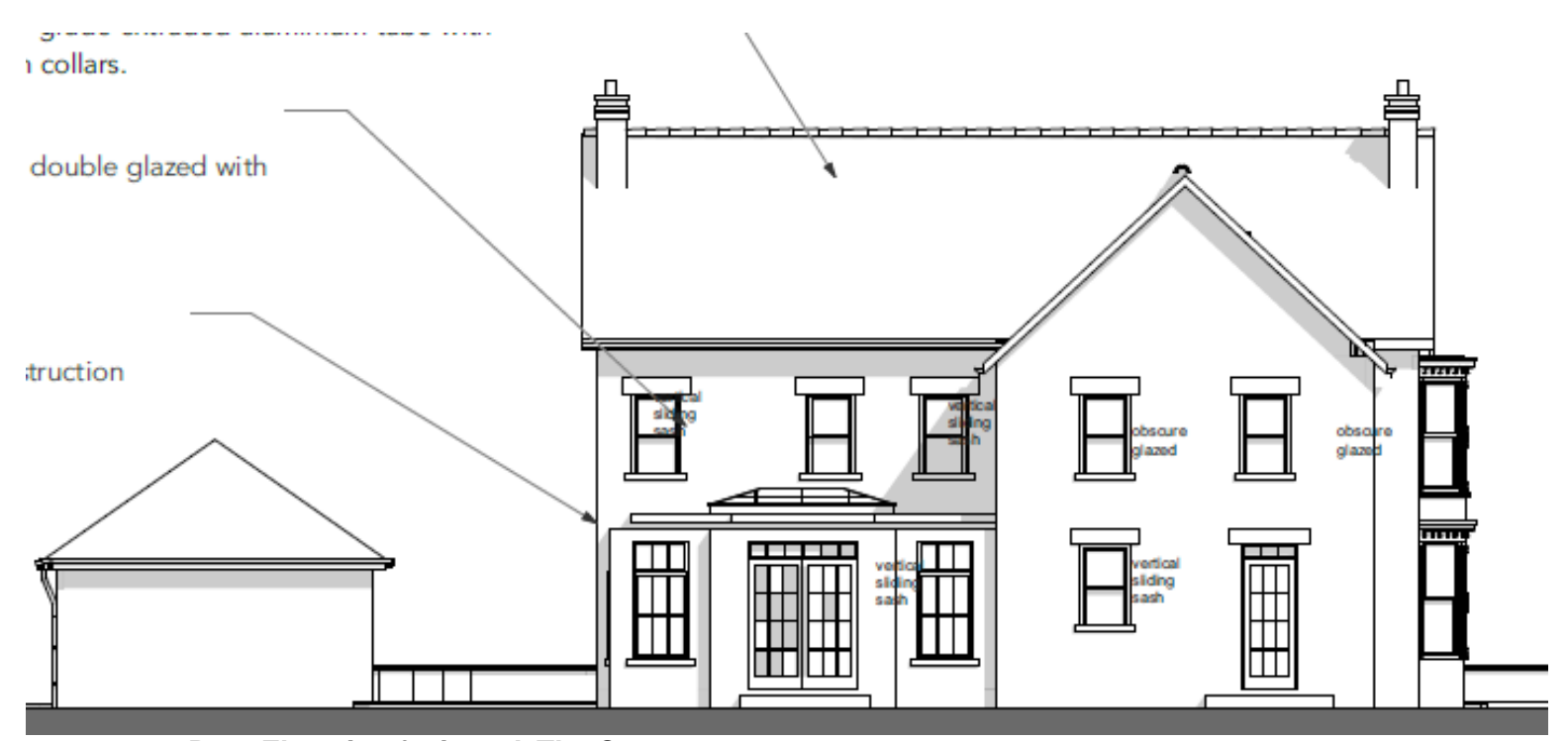
Rear Elevation facing 4A The Crescent