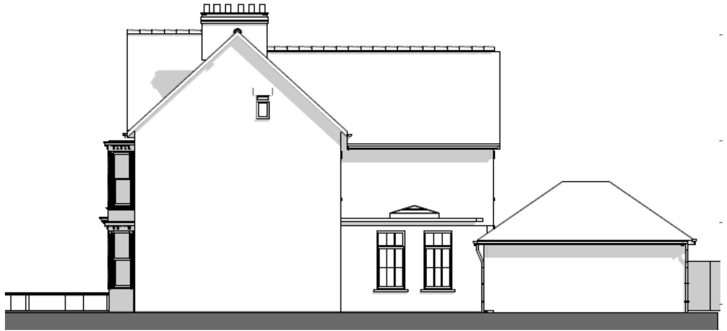
Side elevation facing 25 Cornfield Road