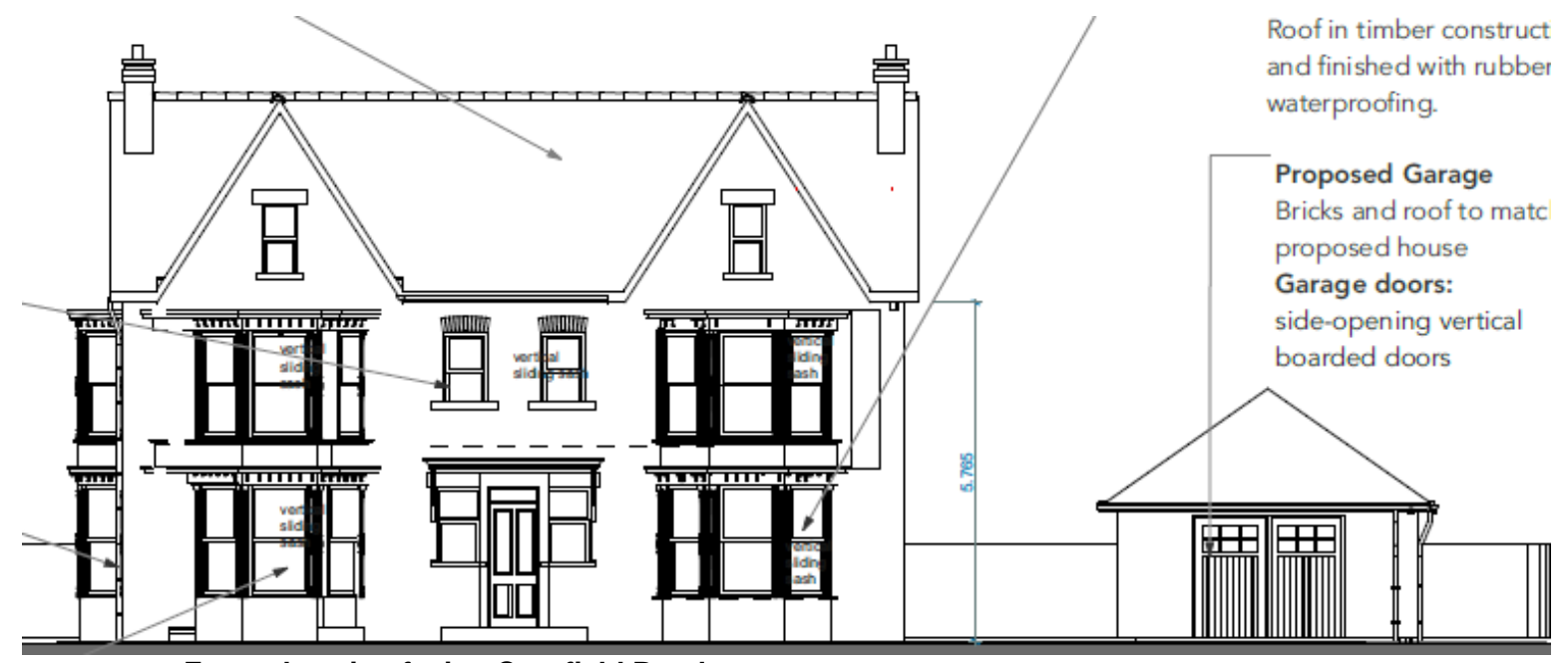
Front elevation facing Cornfield Road